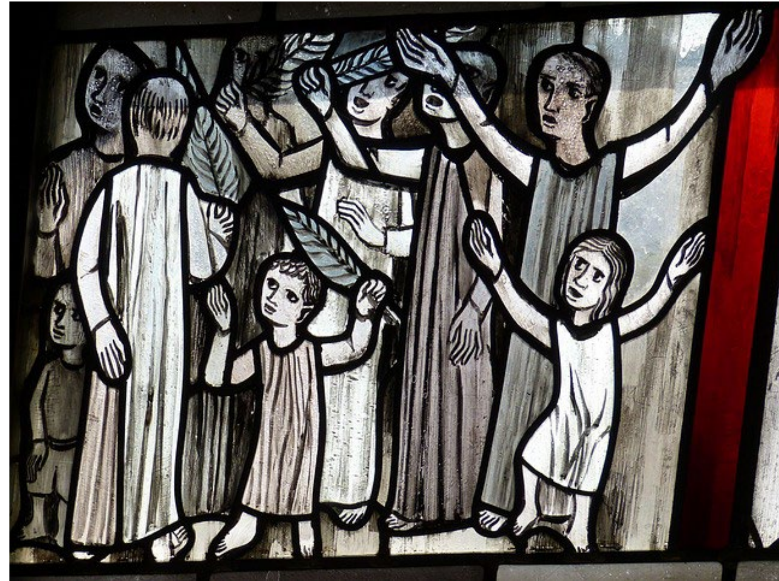
The People of Washington Avenue Christian Church (Disciples of Christ) gather for the