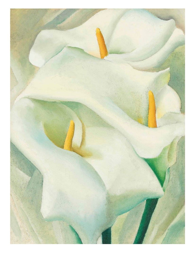
The People of Washington Avenue Christian Church (Disciples of Christ) gather for the