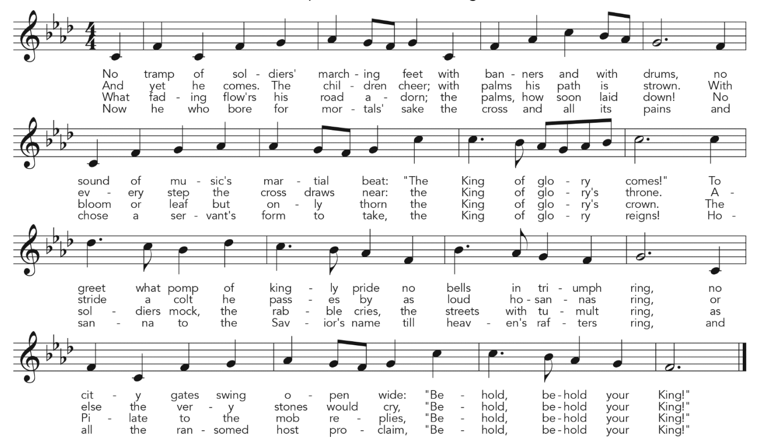
No Tramp of Soldiers' Marching Feet